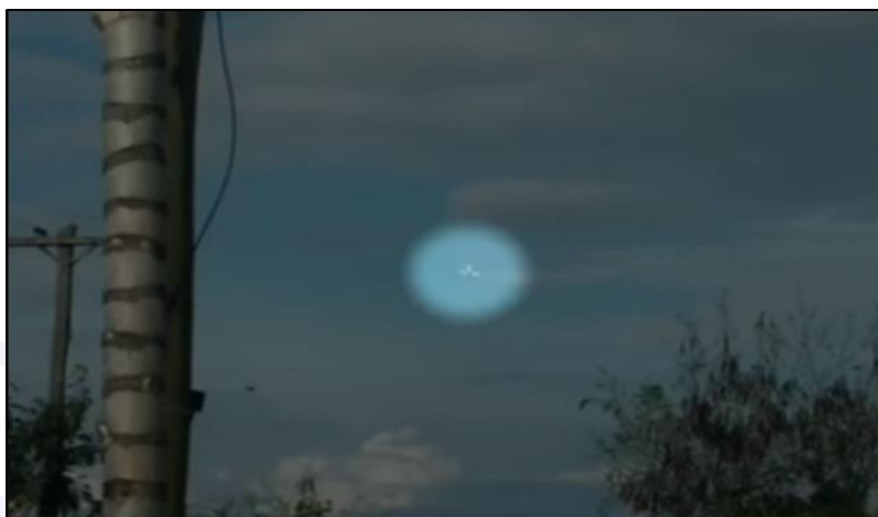
Figure 3 – Final trajectory of the aircraft.