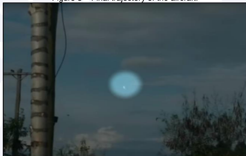
Figure 4 – Final trajectory of the aircraft.

It was possible to see in the filming that the final trajectory of the aircraft happened in spin. The aircraft in question was not approved for the execution of this exercise.